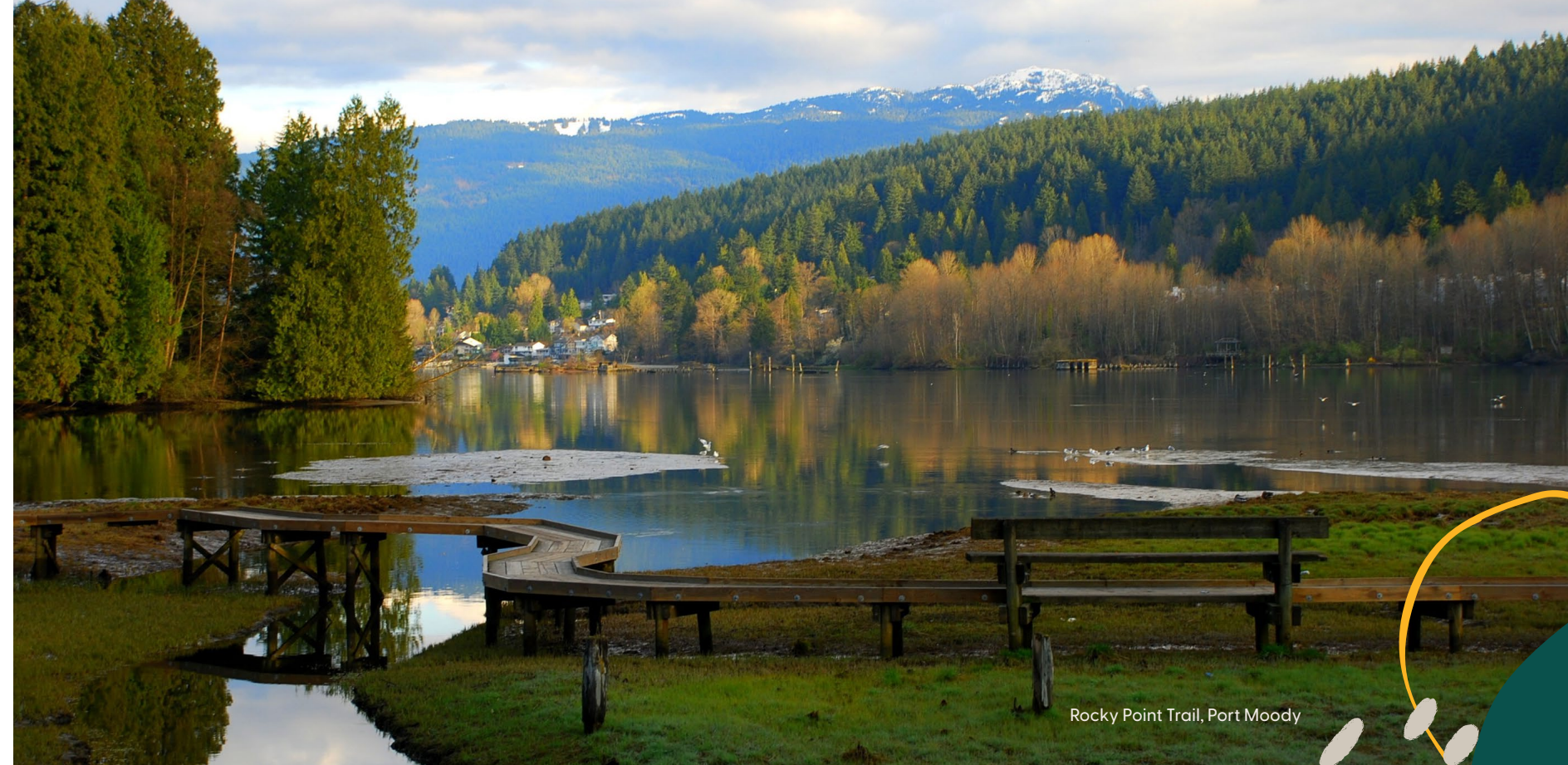
Rocky Point Trail, Port Moody