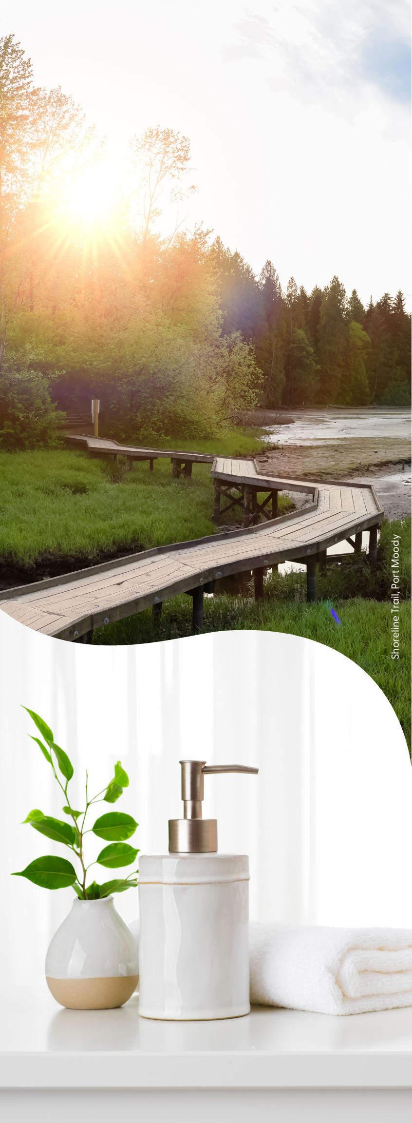
Shoreline Trail, Port Moody